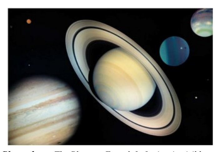
Photo above: The Planets. From left, Jupiter in visible light; Saturn in visible light; Uranus in near-infrared light; Neptune in false colors to capture its chemical composition. Upper left: Mars in visible light.