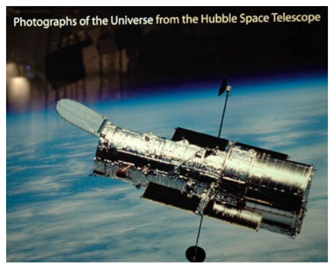
Photo above: Hubble is 15.9 meters (43.5 feet) long, about the length of a school bus, and weighs 11,110 kilograms (24,500 lbs.), about as much as two elephants.

Making its debut appearance in the Pacific Northwest, "Hubble Space Telescope: New Views of the Universe" is a 2,500-square-foot NASA exhibition, which runs through May 31, 2013. This exhibit immerses visitors in the magnificence and mystery of the Hubble mission. A scale model of the Hubble is the focal point of the installation, while "satellite" displays incorporate hands-on activities about how the telescope works. A "space/time" section features Hubble's contributions to the exploration of planets, stars, galaxies and the universe. In addition, the exhibit contains spectacular color images and data on planets, galaxies, black holes, and many other fascinating cosmic entities taken from Hubble.